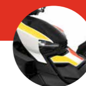
Heritage White IV