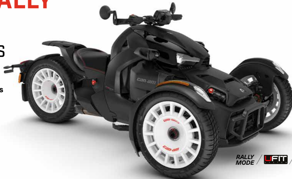
SHOWN WITH INTENSE BLACK PANELS